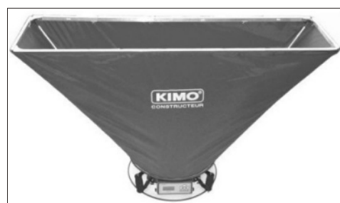
DBM Kimo with hood 1500 x 400 mm