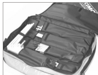
Fitted carrying case.